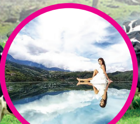
幻境园打卡 Culvert View