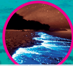
观看蓝色浮游生物 Blue Plankton Watch