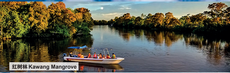
红树林 Kawang Mangrove