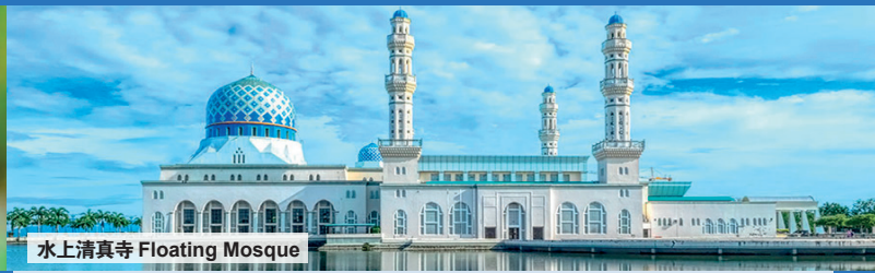
水上清真寺 Floating Mosque