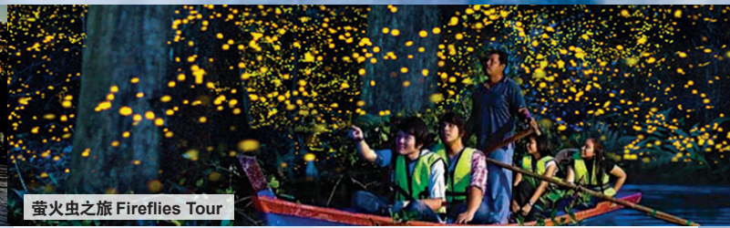
萤火虫之旅 Fireflies Tour