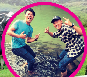
天然鱼疗鲁安帝村 Fish Spa Kampung Luanti