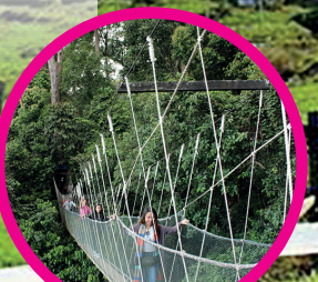
树顶雨林吊桥 Canopy Walk