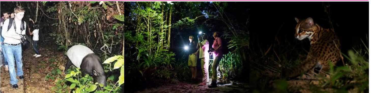
✿ 夜游丛林 @ Night Jungle Walk