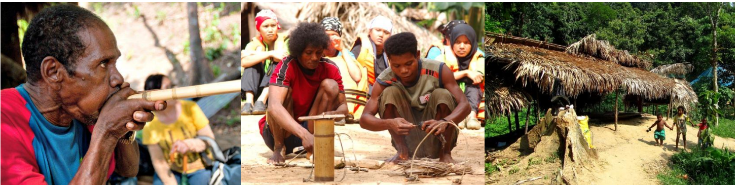
✿ 原住民村落 @ Aboriginal Settlement