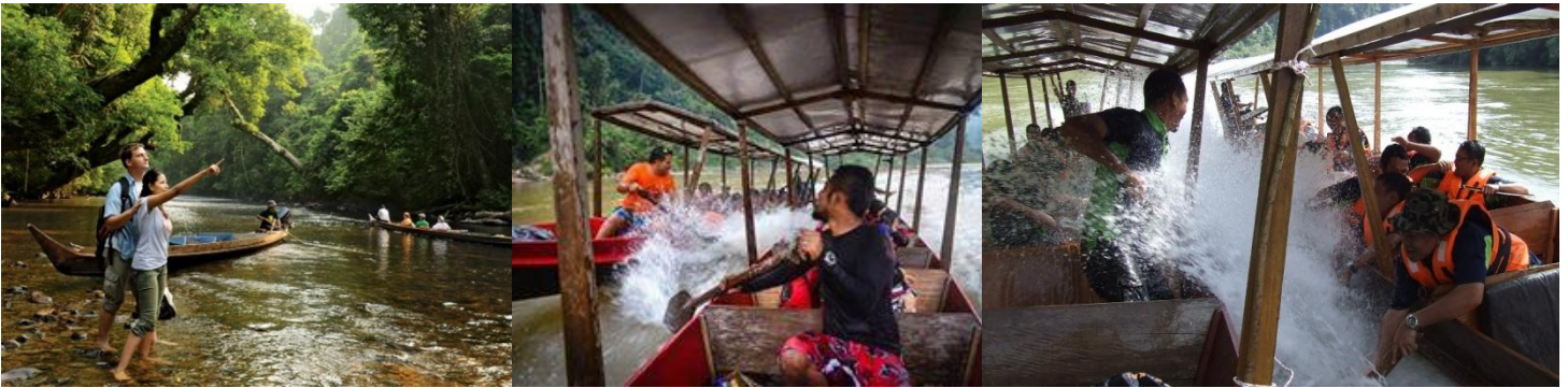
✿ 泛舟激流 @ Rapid Shooting