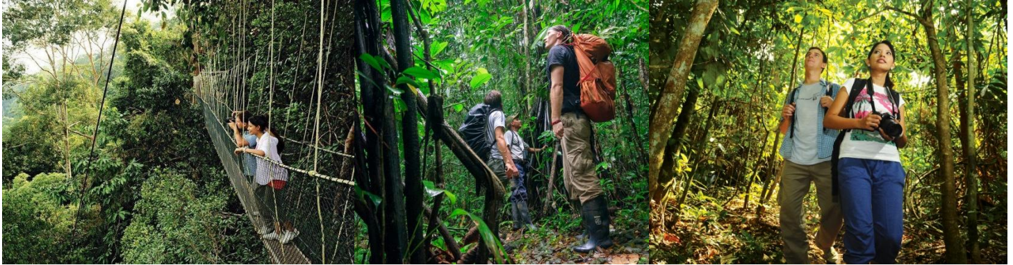
✿ 徒步丛林 & 雨林吊桥 @ Jungle Trekking & Canopy Walkway