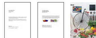
#1 Black Text #2 Black Text and graphics #3 Photo 4R (4 x 6 ")

†1 Print speed (Pages Per Minute) is calculated when printed on A4 plain paper in the fastest mode, 10 x 15 cm photo print speed when printed on Epson Premium Glossy Photo Paper. Print speed may vary depending on system configuration, print mode, document complexity, software, type of paper used and connectivity. Print speed does not include processing time on host computer.