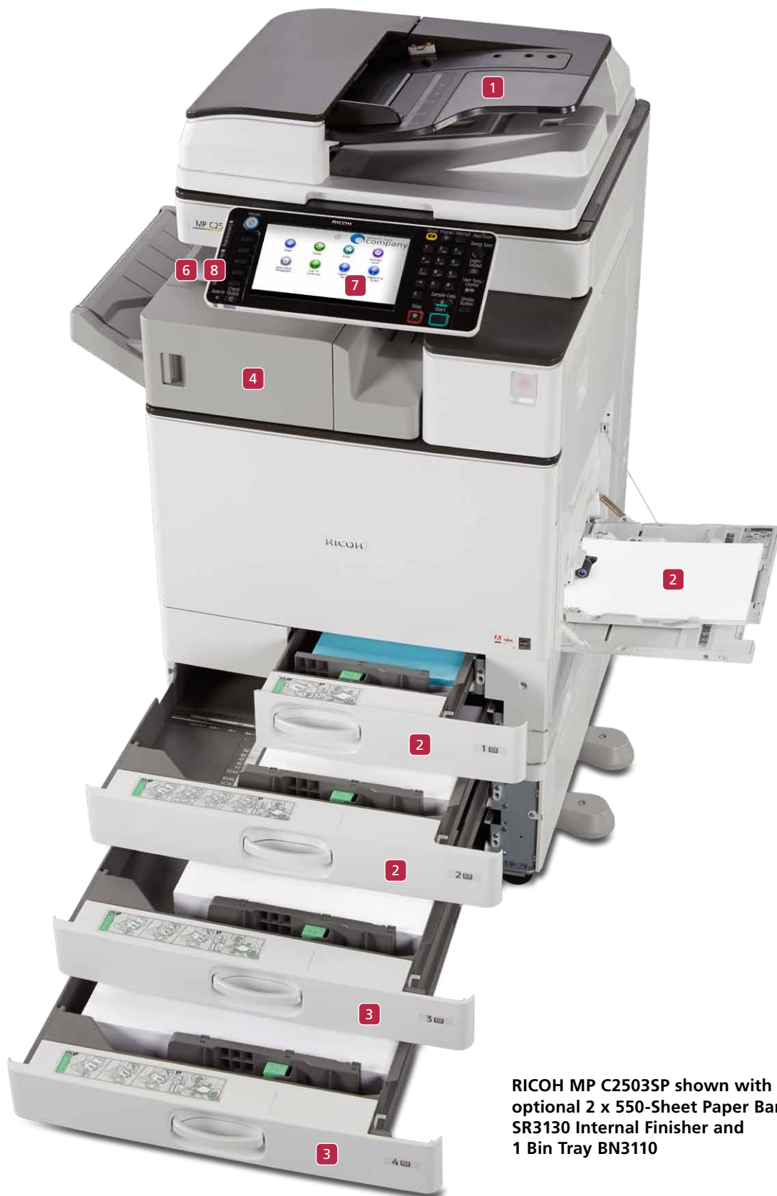
RICOH MP C2503SP shown with optional 2 x 550-Sheet Paper Bank, SR3130 Internal Finisher and 1 Bin Tray BN3110