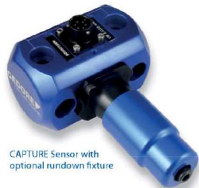
CAPTURE Sensor with optional rundown fixture

Calibrated range: 10% to 100% of capacity