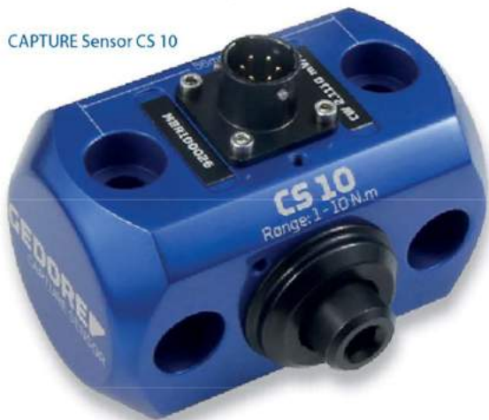
CAPTURE Sensor CS 10

The CAPTURE Sensor is part of the industry-leading CAPTURE system, providing highly accurate torque measurement for Hand and Power Torque Tools.