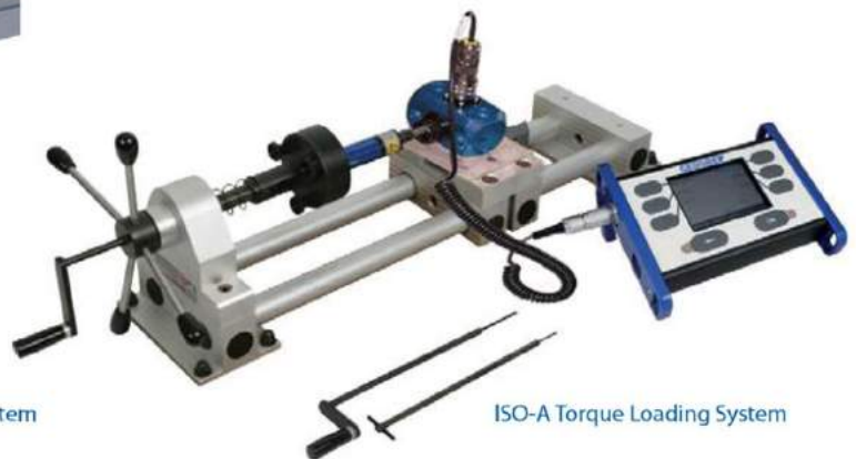
ISO-A Torque Loading System

For more information: Tool Selector; gedore-torque.com/tool-selector Telephone; +44 (0) 1483 894 476 Videos; www.youtube.com/gedore-torque Email; salesandrepairs@gedore-torque.com