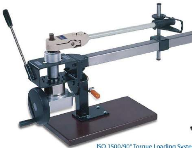
ISO 1500/90° Torque Loading System

ISO accreditation. Meets the International Standard ISO 6789 for the calibration of Torque Wrenches