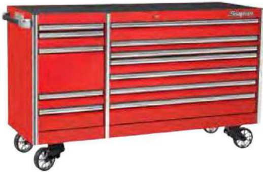
KERP842COPBO 84" EPIQ with PowerDrawer Unit and PowerTop™