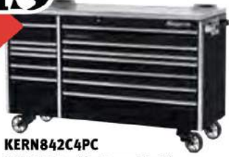
KERN842C4PC 84" EPIQ with PowerTop™