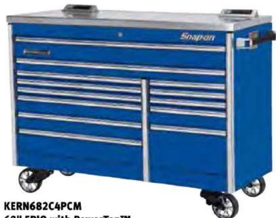
KERN682C4PCM 68" EPIQ with PowerTop™