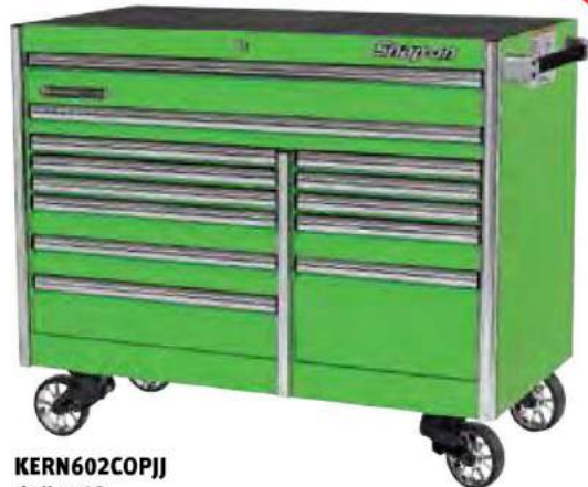
KERN602COPJJ 60" EPIQ