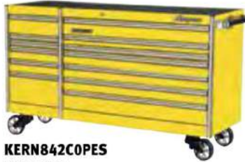
KERN842C0PES 84" EPIQ