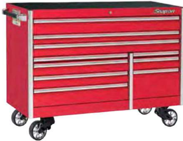
KETN682B0PBO 68" EPIQ