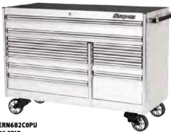
KERN682C0PU 68" EPIQ