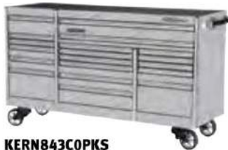
KERN843C0PKS 84" EPIQ