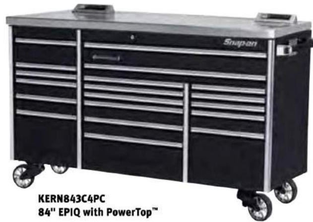
KERN843C4PC 84" EPIQ with PowerTop™