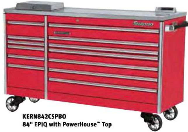
KERN842C5PBO 84" EPIQ with PowerHouse™ Top