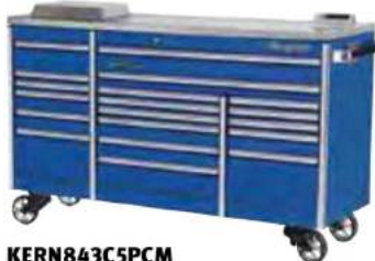
KERN843C5PCM 84" EPIQ with PowerHouse™ Top