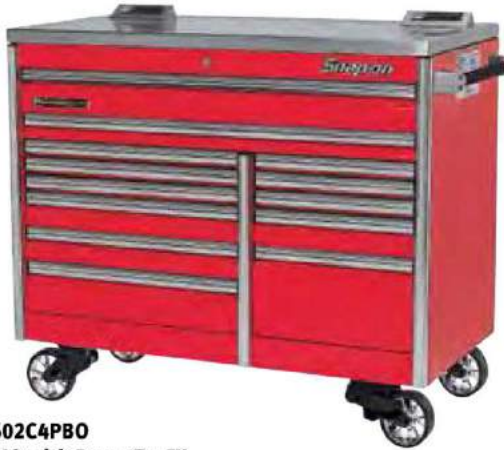
KERN602C4PBO 60" EPIQ with PowerTop™