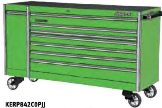
KERP842COPJJ 84" EPIQ with PowerDrawer Unit