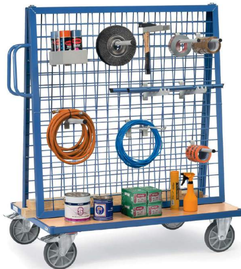
1301 with accessories

To keep things in order • Platform of derived timber material board, surface beech grain • Deachable sides in angular steel superstructure, with welded wire lattice 75 x 75 x 7 mm • Powder coated blue RAL 5007 • 2 swivel and 2 fixed-wheel castors, TPE tyres, hubs with groove ball bearing, swivel castors with wheel lock • variably insertable accessories in different types • Powder coated grey RAL 7035