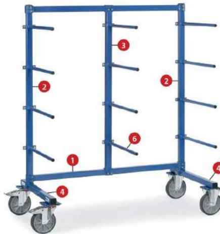
Modules for trolleys with carrier spars