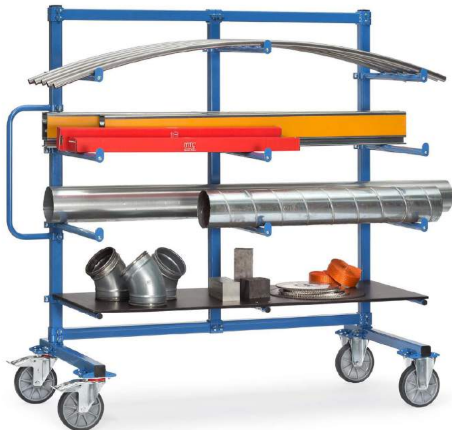
4615-1AS with accessories

A variable system for long goods transport and storage • Robust square tube frame connected with strong clamps • High-quality powder-coating blue RAL 5007 • Infinitely adjustable support arms, optionally available with 600 mm of working length on one side or 370 mm of working length on both sides • Trolley can be extended as required with additional components • Versatile accessories such as PVC hose, roll-off protection, push handle and wooden base • 2 swivel and 2 fixed-wheel castors with TPE tyres, hubs with deep groove ball bearing • Wheel-locking devices on the castors