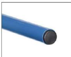
Trolley with carrier spars with PVC hose