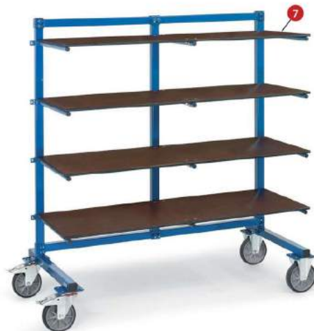
Shelves for trolleys with carrier spars