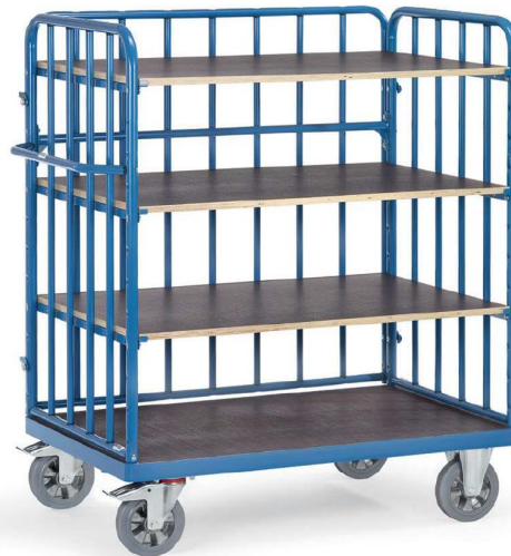
18212-1 | 18213-1