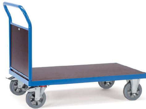
12512 | 12513 | 12515 | 12516