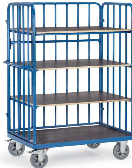
18312-1 | 18313-1