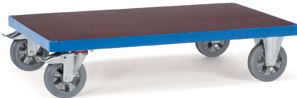
12592 | 12593 | 12595 | 12596