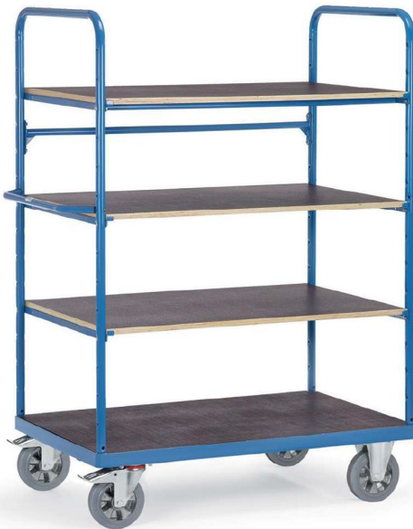
18302 | 18303