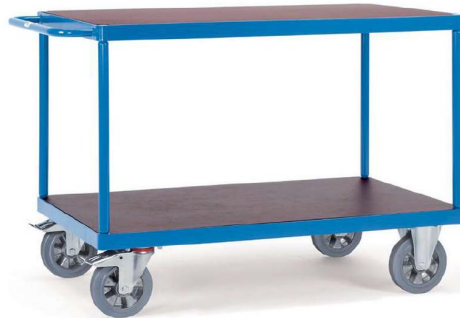
12402 | 12403 | 12405 | 12406