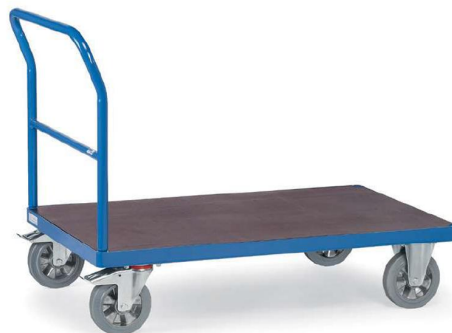
12502 | 12503 | 12505 | 12506