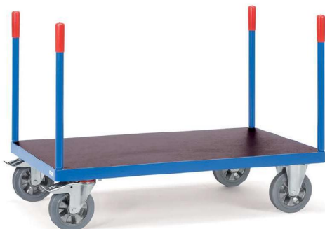
12582 | 12583 | 12585 | 12586