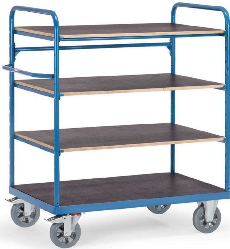
18202 | 18203