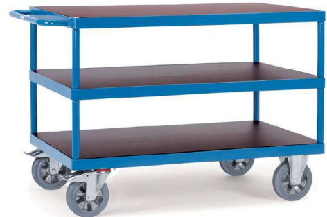
12422 | 12423 | 12425 | 12426