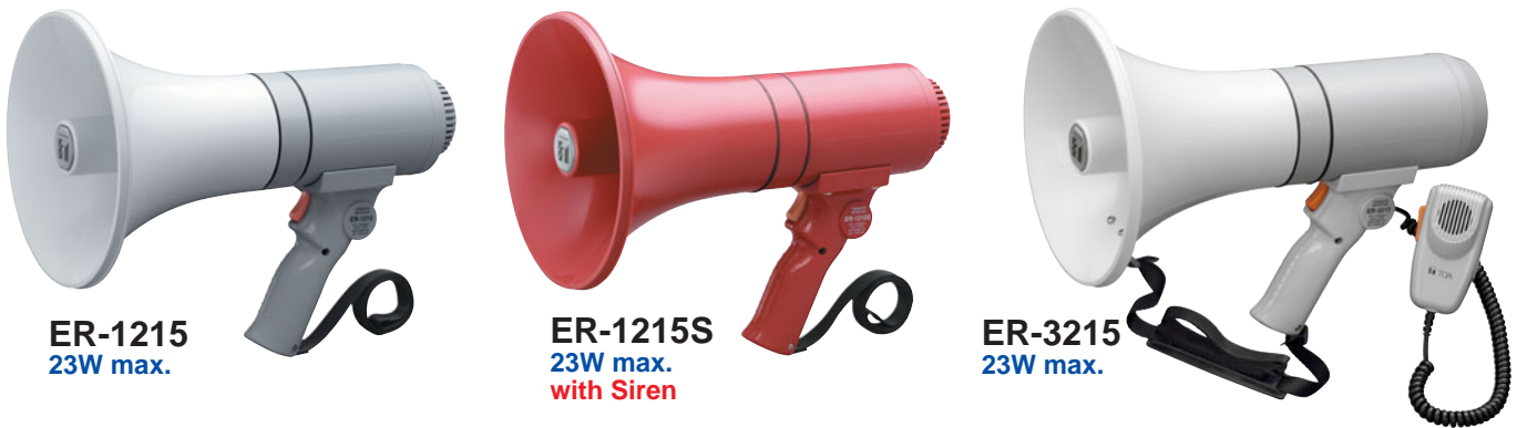
ER-1215 23W max.