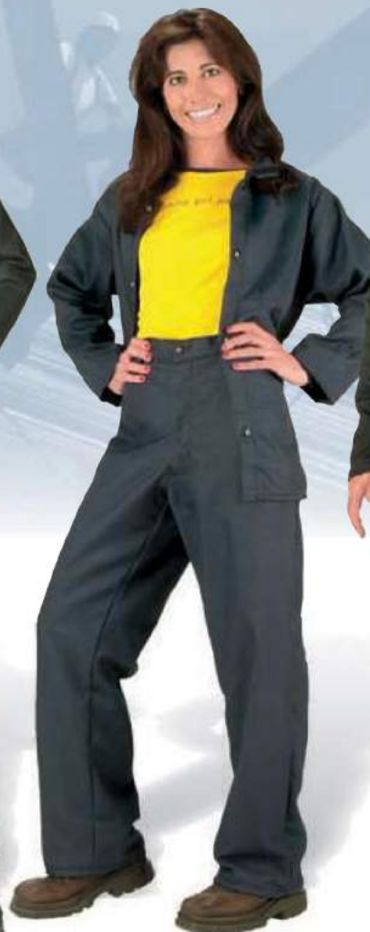
600-(Fabric) and 606-(Fabric)