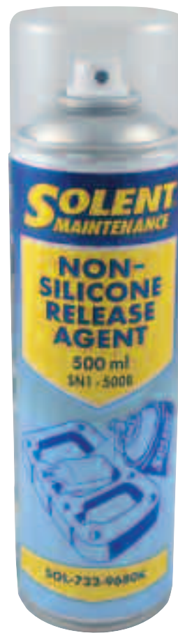
Size 500ml Order Code SOL-732 -9680K

Specifically formulated for rapid release of moulded components. Particularly suitable for moulded items which require further process, eg painting, printing and thermo welding.