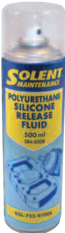
Size 500ml Order Code SOL-732 -9700K

Specifically for use with integral skin and elastomeric polyurethanes. Provides high gloss finish, low build-up on the mould surface generated to 200°C. Silicone based product may not be suitable for use where painting, plating work is required.