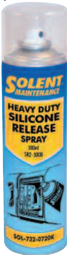
Size 500ml Order Code SOL-732 -0720K

Heavy duty silicone lubricant and release agent. Formulated with a high silicone content. Suitable for a wide range of uses. SR2-500B is a dry non-oily, non-greasy product. Water clear with no odour.