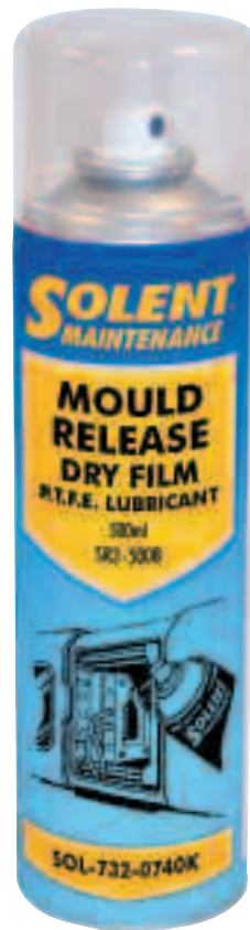
Size 500ml Order Code SOL-732 -0740K

Provides a micro-thin surface coating for the inner surfaces of injection moulding tools/dies, thus enabling easy component release. The coating will not bridge complex mould profiles and will not interfere with precision fits. The applied PTFE film will not transfer to the moulded item and can be used where a dry slip surface is required such as production line slides, tracks or tables.