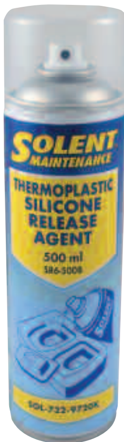
Size 500ml Order Code SOL-732 -9720K

Silicone based. Formulated to provide effective release of plastics with lower melt temperatures. Effective with natural rubbers. Effective to 200°C, excellent surface finish.