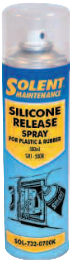
Size 500ml Order Code SOL-732 -0700K

The product is suitable for a wide range of uses. SR1-500B is a dry, non-oily, non-greasy product. Water clear with no odour.