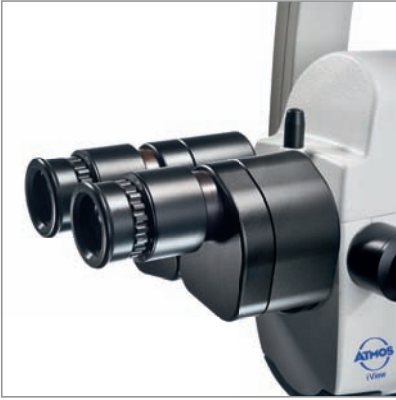
1 Binocular straight lens tube