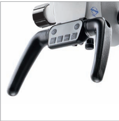
7 Lateral double hand grip