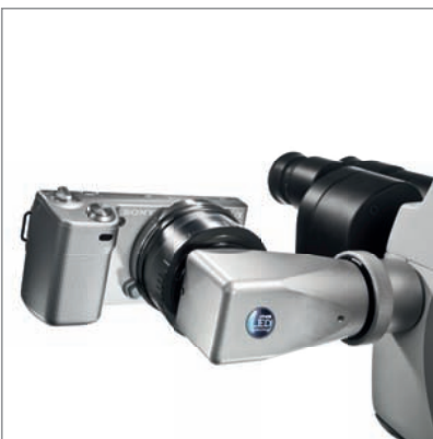
4 HD adapter