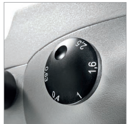
6 Magnification exchanger