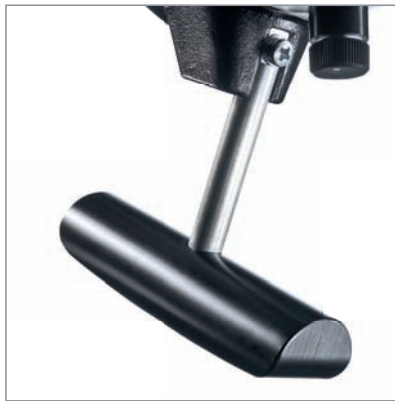
8 T-hand grip