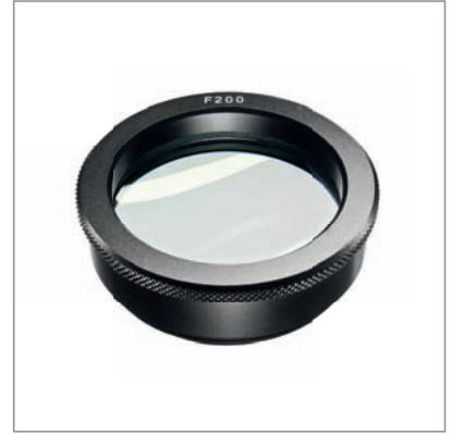
3 Lens (200/250/300/400 mm)