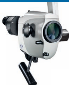
ATMOS® iView 21