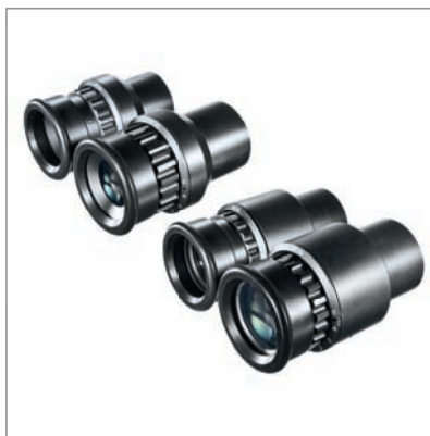
5 Wide range eyepiece lenses 10 x Wide range eyepiece lenses 16