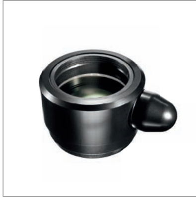
2 Lens with manual focus (200/250/300/400 mm)